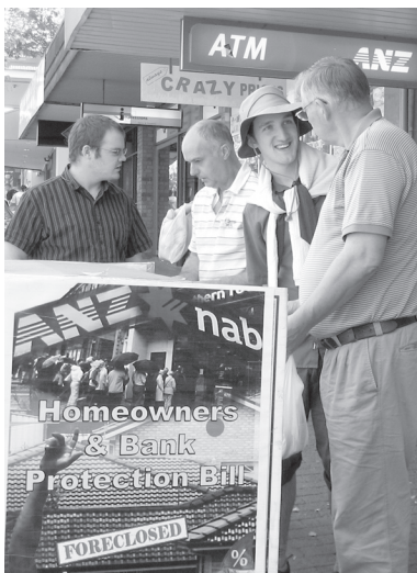
The LaRouche Youth Movement is leading the drive for a legislative firewall to stop mass home foreclosures and a collapse of our banking system.

Into this disaster strode LaRouche's associates in the LYM and