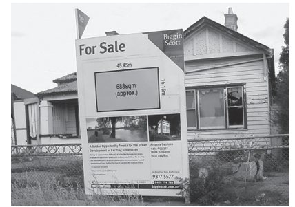
100,000 Australians are already homeless. Additionally, JP Morgan Fujitsu says 300,000 families may be thrown on the streets by July.