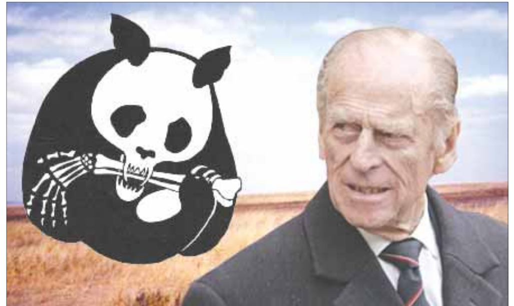
Prince Philip, co-founder of the WWF and ACF, wants you to give him a hand.

It was tasked to the key Crown operatives Bob Hawke, Paul Keating and John Howard to manage the radical shift to "free market" and "environmental" policies—such as the MDBA plan—that have systematically dismantled Australia's physical economic infrastructure and destroyed the nation's ability to support population growth. Hawke and Keating are prominent members of