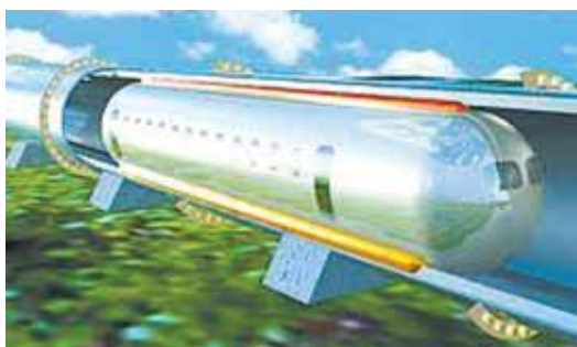
Ultra-high-speed maglev evacuated tube transport.

Dr Davidson suggested building a route across Lake Ontario before the trans-Atlantic crossing, to alleviate concerns about cost and safety. But we Australians have an ideal opportunity to get started first, by linking Tasmania