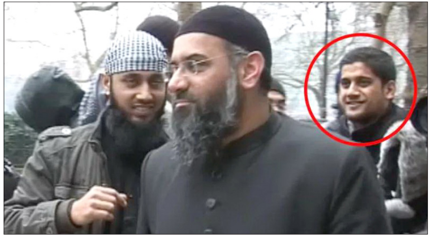
Terrorist recruiter Anjem Choudary is in the foreground of this video grab. Circled at back right is suspected ISIS executioner Siddhartha Dhar, a member of the al-Muhajiroun group, two other members of which were among the perpetrators of the June 2017 vehicle and knife attack at London Bridge.

Husain points to the seriousness of the terrorist threat, with the likes of Choudary back on the streets and terrorists dislodged from Syria disseminating around the globe.