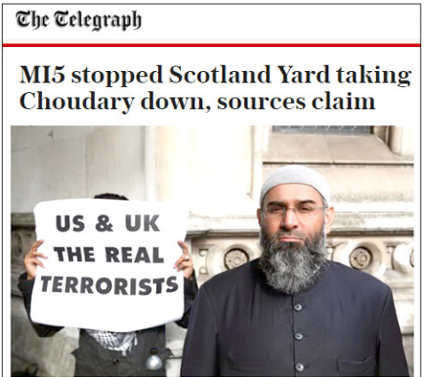
The headline of the 21 August 2016 Telegraph report that MI5 protected terrorist Anjem Choudary.

unquestionably had all the technical capability needed to monitor all of the watched individuals in real time. Binney himself had designed a program for the NSA called Thin Thread, which could conduct such monitoring while excluding the vast majority of the population from the surveillance. In the film A Good American , Binney had stated that "Thin Thread is a program that absolutely would have prevented 9/11", had it been used to target terrorists. After 9/11, Binney had resigned from the NSA in disgust over the agency's conducting mass surveillance of the public instead.