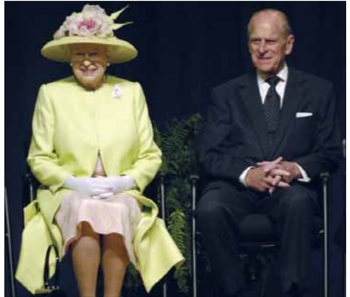
Queen Elizabeth and her "deadly virus" consort Prince Philip run the Empire with one determined commitment—the reduction of the world's population to less than 1 billion—by terrorism, famine, disease, and/or war.

Had Presidents George W. Bush or Barack Obama released those 28 pages, and allowed a thorough investigation into the role of British and Saudi intelligence in the September 2001 attacks, it is quite possible that Ambassador Christopher Stevens and the other American diplomats and security officers who were killed or injured