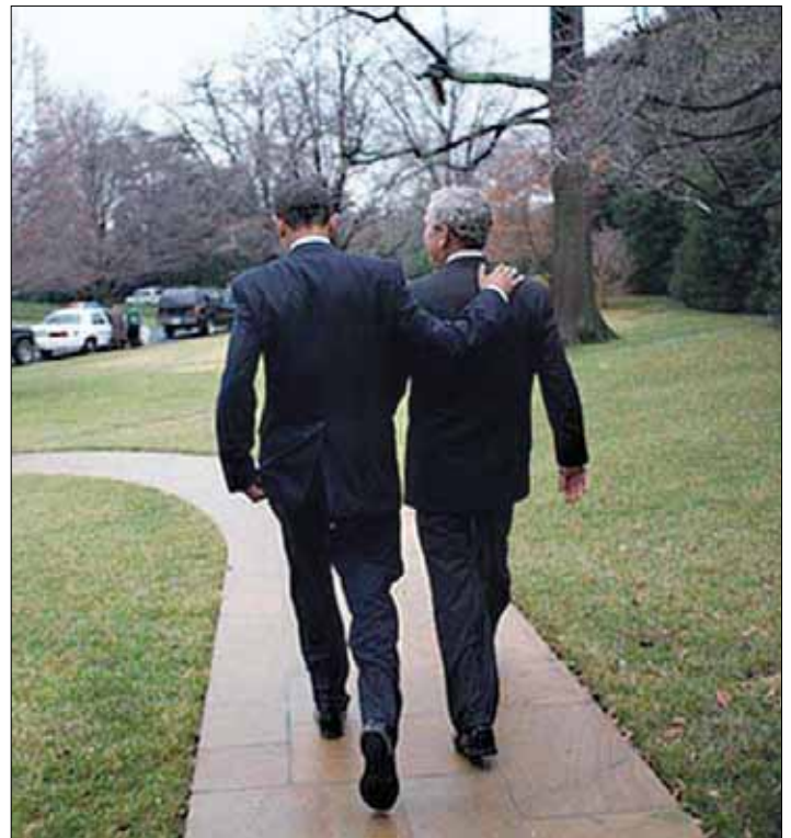
Obama and Bush: joined in policies, joined in cover-up.

It is that British policy that must be stopped. The suppressed 28 pages from the Congressional Joint Inquiry are the crucial entry point for exposing the true nature of the Sept. 11, 2001 attacks and all that followed. Open that door and the entire Anglo-Saudi war against civilization can be exposed. From Bandar to BAE to the British Crown, the true masterminds of the heinous crime of 9/11 can be revealed. Those in the United States who have been complicit in the coverup of that crime can and must, as well, be brought to justice—including those currently occupying the highest office in the land.