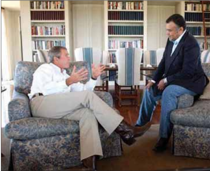
President Bush and Saudi Ambassador Prince Bandar in Crawford, Tex., Aug. 27, 2002. The Prince was implicated in funding the 9/11 attacks the previous year, but that didn't disrupt their friendly relationship.

from attack. The fact that two successive American Presidents—George W. Bush and Barack Obama—have put their personal imprimatur on the coverup of the British and Saudi monarchies' role in funding and orchestrating terrorism is grounds for prosecution and impeachment.