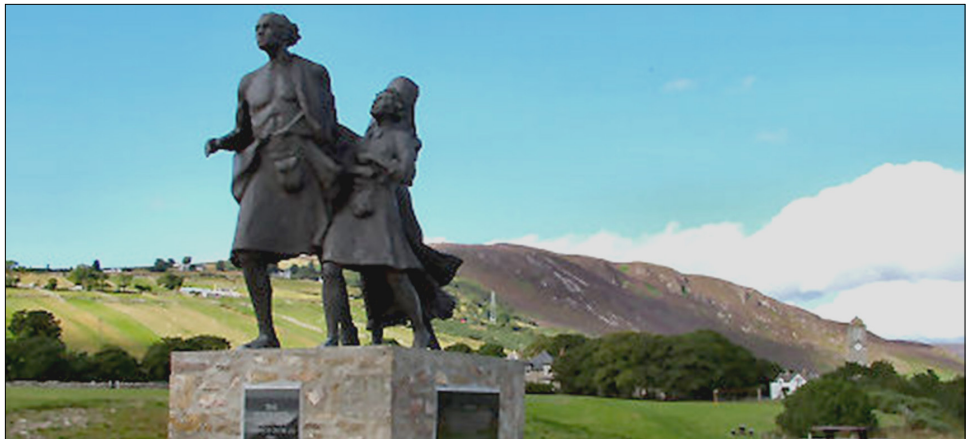
A statue in Helmsdale, which commemorates the people who were forced to leave their homes and lands and had to emigrate to the new world.

By the early 1800s, four million acres or 25 per cent of arable Irish land was unused for any purpose. In 1829 the famous Duke of Wellington commented that "there never was a country in which poverty existed to the extent it exists in Ireland." By the 1840s, Ireland had 164 miles of railways, compared to England's 6,621; it had 60 per cent unemployment, just 39 hospitals to serve eight million people, no more woolen, linen, poplin, furniture, and glass manufacture, and even the water-powered grain mills which Ireland