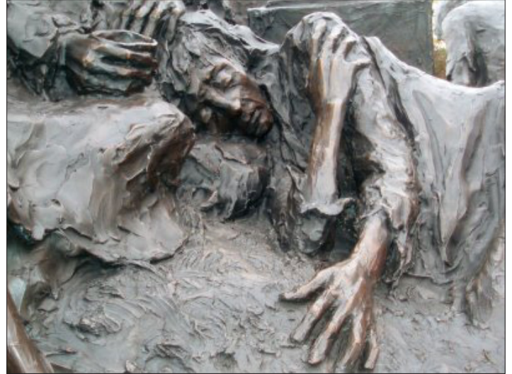
A sculpture of a victim of the Irish famine.

Right now, Australia is being targeted for genocide in a similar fashion: our domestic food supplies are being systematically shut down, while what remains is being seized by foreign interests. As the keystone to this plot, and as it did historically in its imperial "land clearances" in Ireland, Scotland, and Africa, for instance, the British Crown has enacted a plan to "clear" our national food bowl, the Murray-Darling Basin, of most of its food production and farming communities. That Murray-Darling "clearance", in turn,