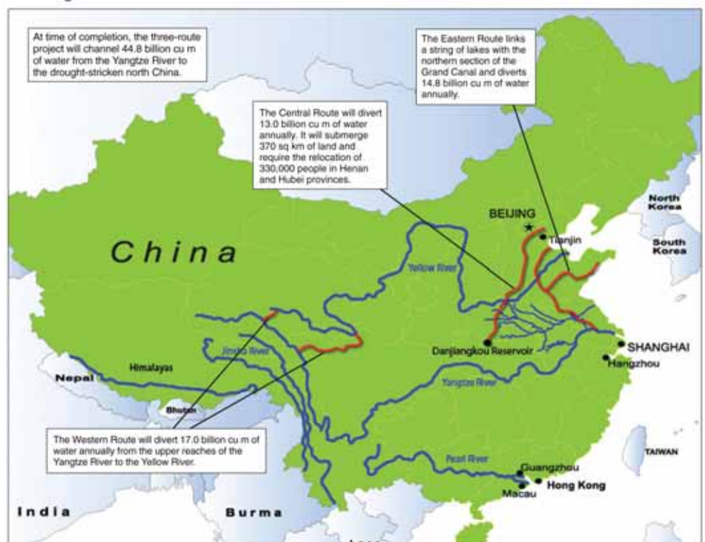
FIGURE 1 Watering the North

Sources: Chinese Ministry of Water Resources; futuretimeline.net; Will Fox