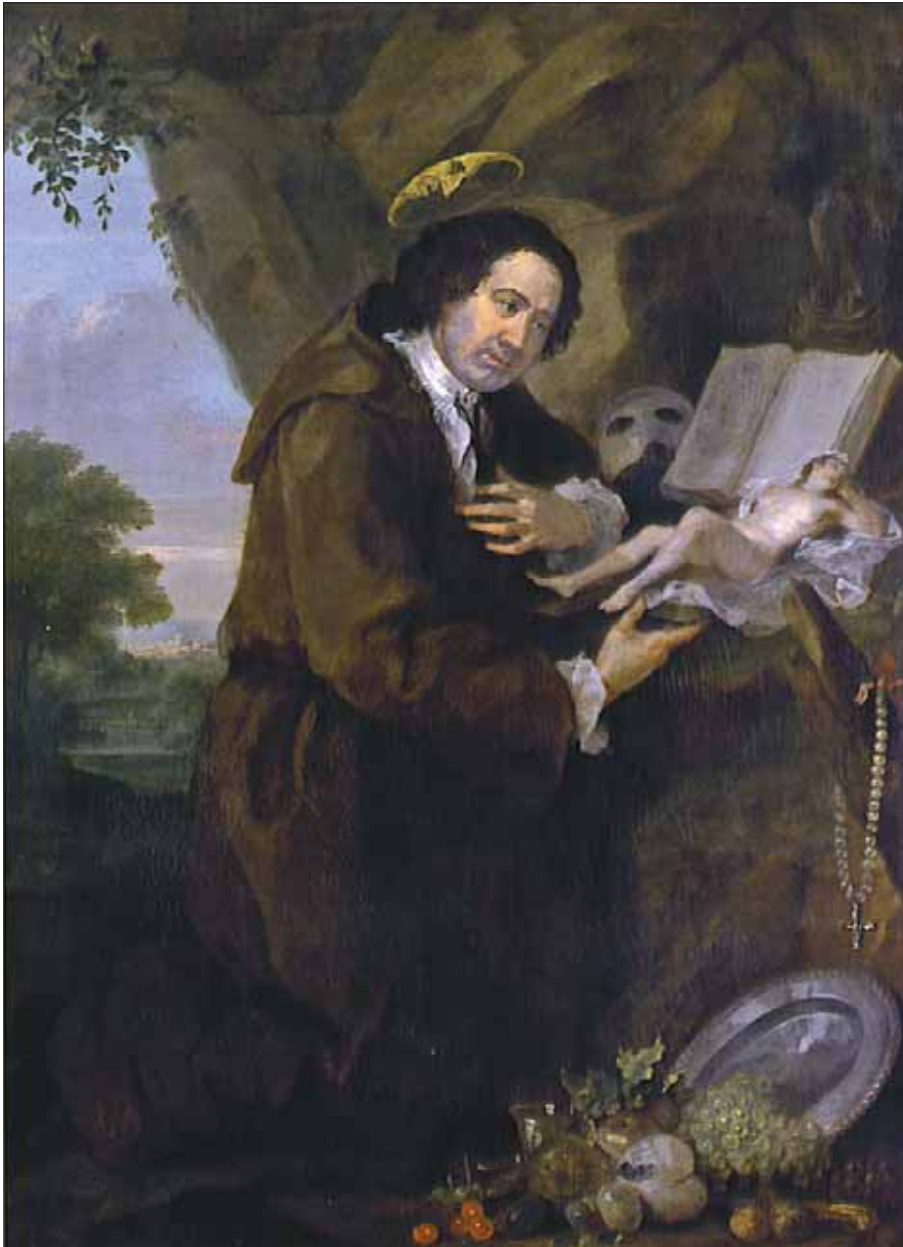
Figure 58. Sir Friar Francis and his Devotions.

In 1757, Dashwood commissioned William Hogarth to mimic Knapp's painting in yet another portrait as a member of the Roman Catholic clergy. Sir Francis Dashwood at His Devotions, modelled on Agostino Carracci's St. Francis Adoring the Cross portrays him leering at a naked, prostrate woman. An open book, referring to the poems of Ovid, and a masquerade mask lie nearby as a tray of fruits and wine tumbles to the floor, referring the viewer to the excess of Carnival and the attendant rites of Bacchus and Venus. The nimbus over his head is the profile of his friend and fellow Medmenham Monk John Montagu, 4th Earl of Sandwich. This is a pivotal piece in the history of the group.