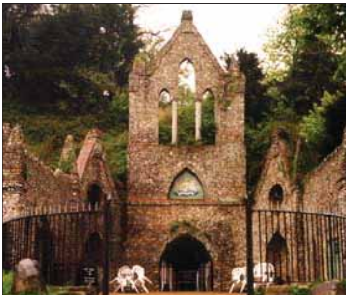
Figure 56. Picture of the Hell-Fire Club.

They had the "breaking-in house, which Lord Sandwich himself boasted that "the corruption of innocence, for its own sake, is necessary", because he enjoyed it. While Sandwich had his "breaking-in house" Dashwood had his baboon. Yes they had an ape! Whilst practising their Black Masses, there were members who practised their religious rites by sodomizing an ape. The ape, who was wearing women's clothing, got loose and ran around the local town, which caused a big scandal. You can imagine why the ape ran away, but after they'd recaptured