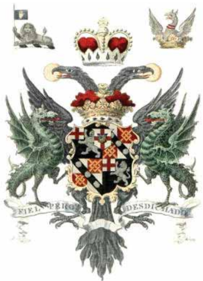
Figure 51. Dragon Lion Crest of the Marlborough Family.

Here is the family crest of the Marlborough Family. The Churchill crowd, the ancestry of that pig Winston. And look what it has on it. Saint George’s dragons and lions. [See Figure 51]