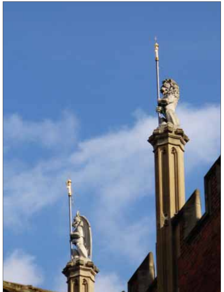
Figure 52. Hampton Court, where Prince Charles resides today. Here we have 3 pictures of "The King's Staircase" murals, painted by the Venetian artist Antonio Verrio, along with the two huge columns outside Hampton Court with the lions on top.