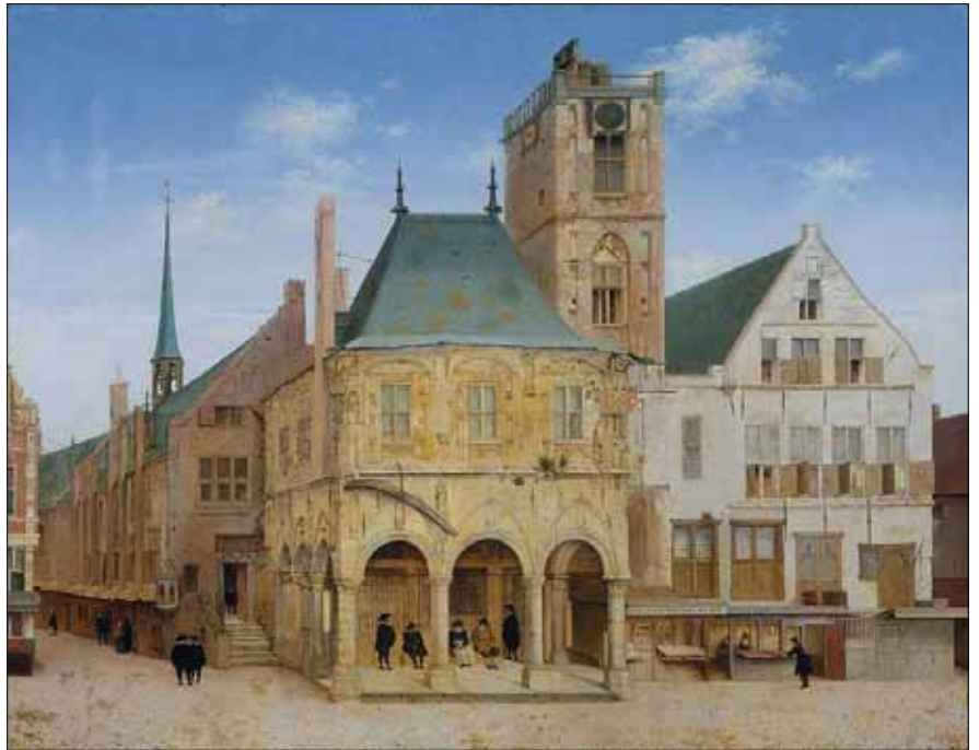
Figure 49. Bank of Amsterdam.