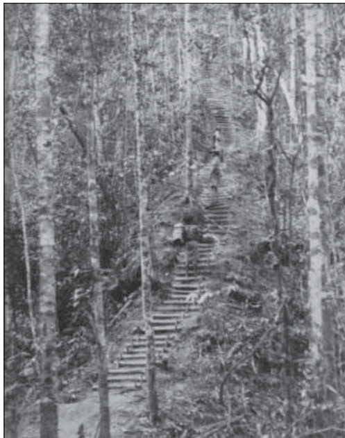
The infamous Kokoda track going up the Owen Stanley Range.

John Curtin died suddenly on July 5, 1945, a month before the Japanese surrender. As MacArthur said of him, "He was one of the greatest of wartime statesmen, and the preservation of Australia from invasion will be his immemorial monument."