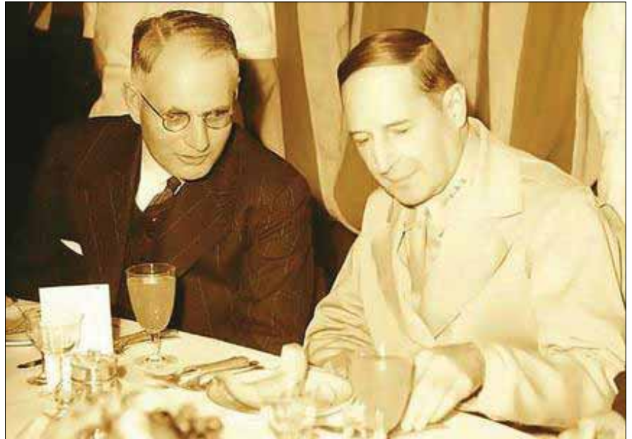
Australian Prime Minister John Curtin with General Douglas MacArthur.