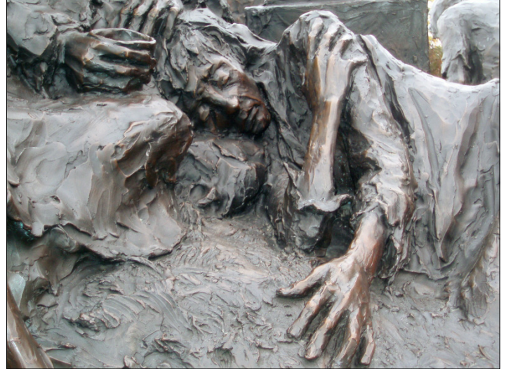
Top: Appropriate contemporary portrait of Sir William Petty. Bottom: Irish Famine memorial in Pennsylvania, USA.