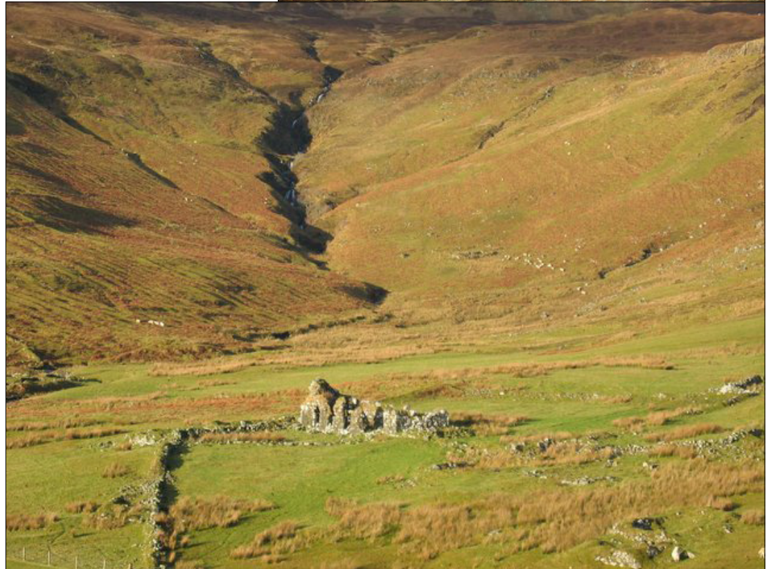
Top: The Last of the Clan, by Thomas Faed, depicts a Scottish family set to emigrate. Bottom: The wild bare highlands of Scotland, after being cleared of its abundant Gaelic-speaking Scottish population, leaving only the ruins of highland housing.