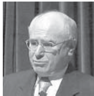
John Howard is continuing the fascist tradition of his father in ramming through draconian police-state laws.