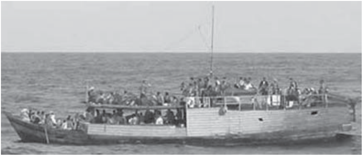
A total of 421 people were aboard SIEVX. This boat is not SIEVX. SIEVX was smaller and carried nearly 200 more passengers, which included 146 children, 142 women, 65 men, who drowned.

worthy condition of the boat; the Howard government's almost-fanatical insistence—later disproven—that the boat sank in Indonesian waters; the mysterious failure of the huge Australian air-and-maritime anti-smuggling presence either to intercept the craft at sea, or at least rescue the survivors. Australia's former Ambassador to Indonesia, Tony Kevin, aggressively questioned the strange circumstances of the sinking; his persistence unleashed investigative reporting from Australia, and finally an Australian Senate inquiry. Reviewing all the evidence that had emerged since the fateful night of October 19, 2002, Kevin said in Perth on Feb. 8, 2003, "I believe that the