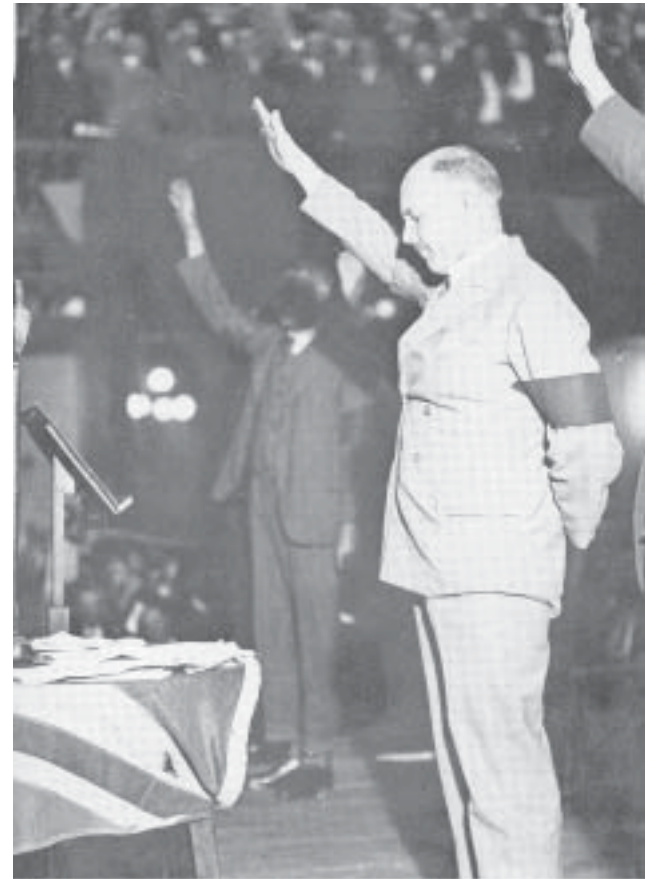
Eric Campbell, founder of the fascist New Guard. Now, as in the 1930s, the choice is either sovereign national banking, or financier-sponsored fascism. The pretext for fascism then, was to "fight the Reds"; today, it is to "fight terrorism".