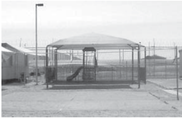
Children's play equipment in the middle of the India compound at the Woomera Detention Centre.

shameless is the Howard government, that in its latest atrocity, the Anti-Terrorism Bill 2004 now before the parliament, it intends to effectively legalise, under Australian law, the regimes at Guantanamo Bay and at Abu Ghraib prison in Iraq. That bill proposes that "an offence against a foreign country" be recognised under Australian domestic law. This would include, specifically, "an offence triable by a military commission of the United States of America established under a Military Order of 13 November 2001 made by the President of the United States and entitled 'Detention, Treatment and Trial of Certain Non-Citizens in the War Against Terrorism.'" That Military Order by President Bush established the lawless hellhole of Guantanamo Bay, whose regime of degradation and torture was then exported to Abu Ghraib in Iraq.