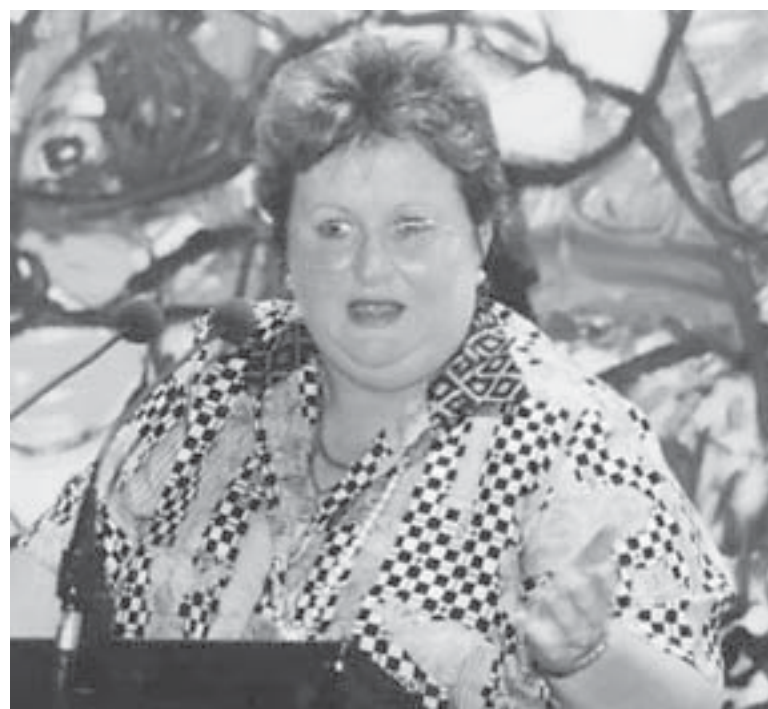
Immigration Minister Amanda Vanstone refused to act to stop children within Detention Centres from being left "severely traumatised and with long-term mental health problems" because it would "send a wrong signal" about Australia's immigration policy.