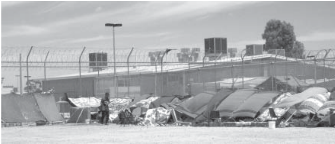
Hunger strikers shelter under bedding around the internal perimeter fence of the main compound of the Woomera Detention Centre.