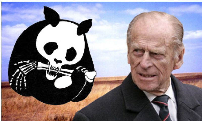
Prince Philip, co-founder of the WWF and ACF, wants you to give him a hand.

It was tasked to the key Crown operatives Bob Hawke, Paul Keating and John Howard to manage the radical shift to "free market"