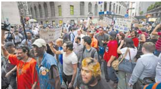
Mass strike: everyday Americans have turned their anger on Wall Street, the City of London's U.S. outpost, demanding the re-enactment of Glass-Steagall to force the financial system to serve the needs of the nation and the people.

"Let's not forget history", he continued. "This idea came from Franklin D. Roosevelt, who put in place the Glass-Steagall Act in 1933, by an act of Congress, against the advice of the banks at the time, of course. It was an order for separation of the banking institutions, according to whether they took risks, or managed their deposits in order not to take risks. It was introduced in Europe after the end of the war. It prevented severe financial crises for us for nearly 60 years.