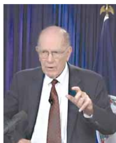
American statesman and physical economist Lyndon H. LaRouche, Jr.

The British/Wall St. coup planning is driven not only by the accelerating financial crash, but by an ever louder clamour for the re-implementation of Glass-Steagall.