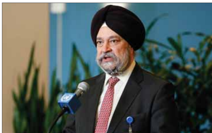
India’s Permanent Representative to the UN, Hardeep Singh Puri, has challenged R2P.

“You know, whenever someone aspires to attain a much-desired end, any means will do. As a rule, they will try and do that by hook or by crook—and hardly ever think of the consequences that will follow. That was the case during the Afghan war after the Soviet Union in 1979 sent its troops to Afghanistan. At that time, our current partners supported a rebel movement there and basically gave rise to al-Qaeda, a United States pet project that