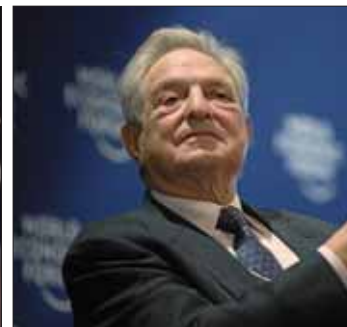
Henry Kissinger and George Soros have also been key proponents of the Responsibility to Protect.

international law by their military campaigns and assassinations in countries like Libya and Syria.