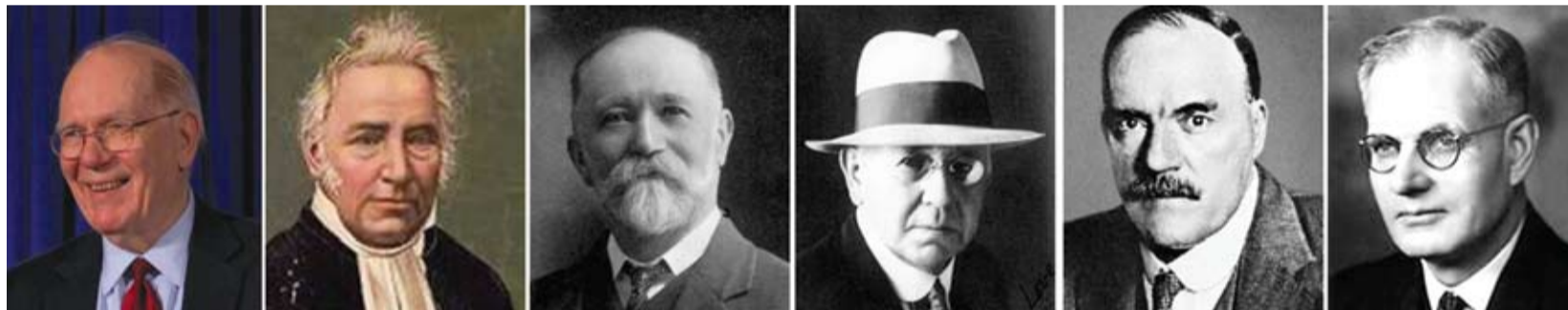
Lyndon LaRouche (left) and Australia's great patriots (left to right) John Dunmore Lang, William G. Spence, Frank Anstey, Jack Lang, John Curtin. All have recognised the City of London as the headquarters of the global monetarist empire determined to destroy sovereign nation-states.

In an international Webcast on 8 th September, this year (see p. 4), LaRouche explained that the heart of British, and all previous imperialisms, is monetarism : "All European imperialism,