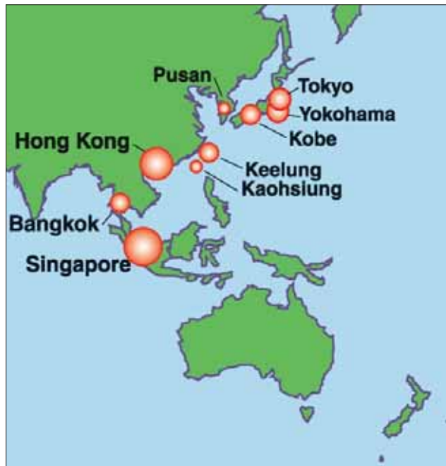
Figure 8: Container port in Asia.

So, here we are again, with fusion power on the agenda once more. With the BRICS developments of 2014, we are determined to lead Australia to its rightful place in a truly human new world economic order.