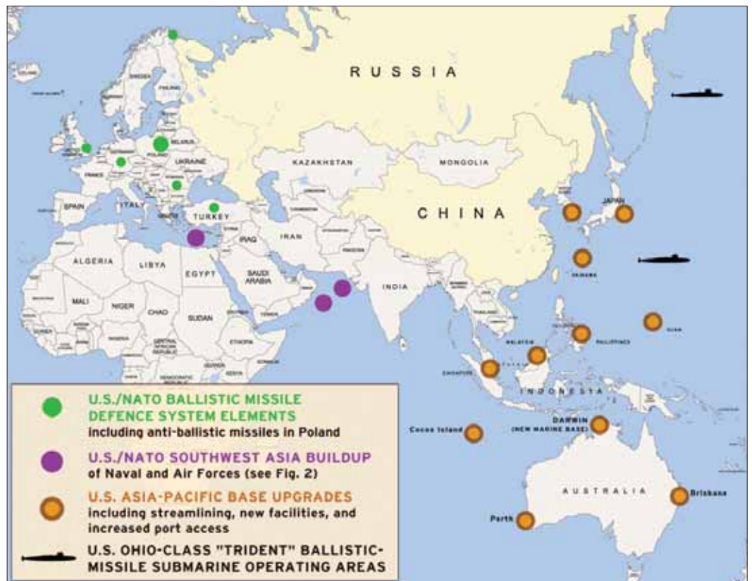
Figure1: Anglo-American military encirclement of Russia and China.

Abbott and Hockey have an extraordinary track record of privatising and looting federal and state infrastructure on behalf of private financiers. While the AIIB plans to spend $50-$100 billion per year on new infrastructure projects, just initially,