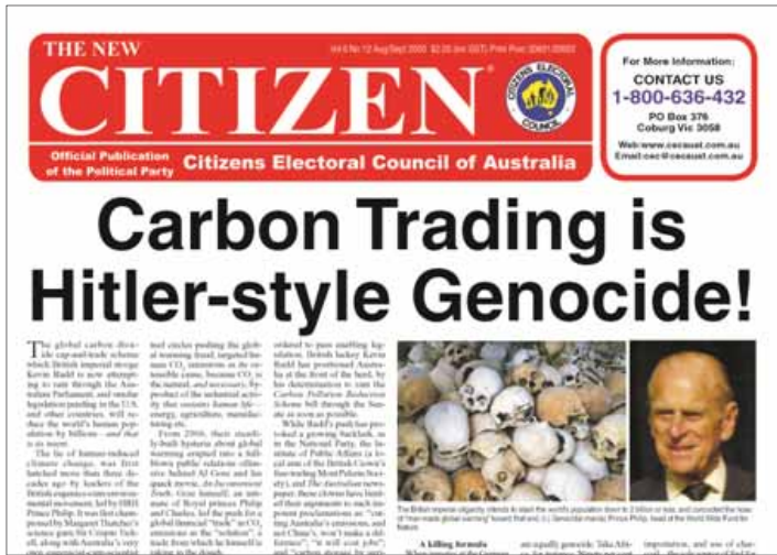
Figure 4: New Citizen Aug./Sept. 2009

I shall go in reverse order, through our fights against green fascism, the Asian Pivot, and the build-up of Australia as an Asian branch office of London and Wall Street.