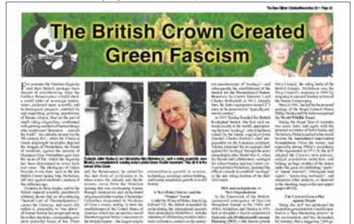
Figure 3: New Citizen Oct./Nov. 2011

Now let’s shift to happier subjects: first, what we in the CEC in Australia have done to frustrate the enemy’s plans, and—alongside our associates in the Schiller Institute and the LaRouche movement globally, and now the BRICS—to defeat that enemy once and for all; and then a word about the role Australia should play in this new, just world economic order.