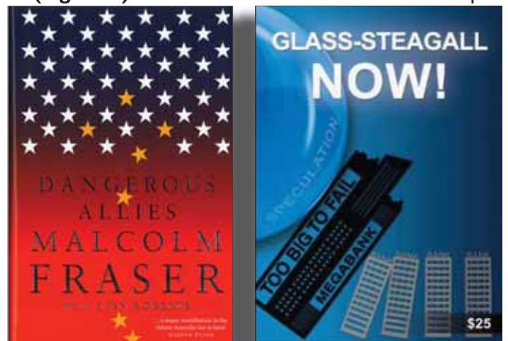
Figure 5: Former PM Malcolm Fraser’s new book.

(Figure 6) We then escalated with 10 thousand copies