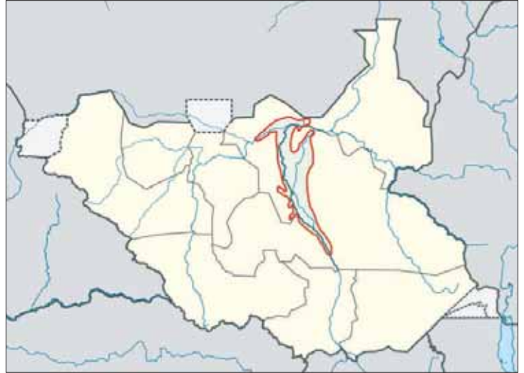
Left (FIGURE 5): The Sudd Swamp in South Sudan (Satellite photo). Right (FIGURE 6): Location of Sudd Ramsar site in South Sudan.

bird life in the Lake Chad basin that must remain off-limits to human projects. One hundred and sixty nations have signed the Ramsar Convention, and there are 1,898 sites on the list. This represents a total surface area of over 186 million hectares (more than five times the area of Germany!).