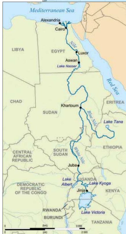
FIGURE 2 The 10 Nations of the Nile Basin Initiative

of water evaporates, or runs off along the way.