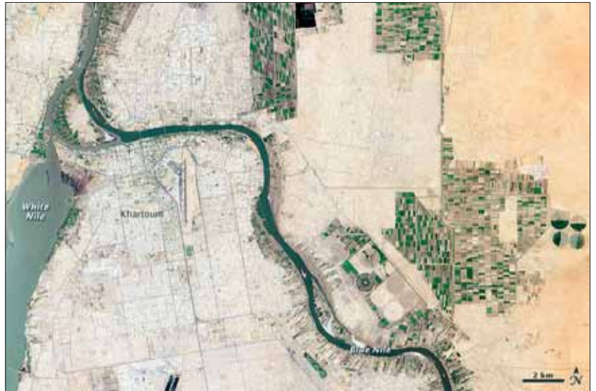
FIGURE 3: White and Blue Niles Converge at Khartoum

According to the standard information, such as from the United Nations Food and Agriculture Organization (FAO), the Nile River, with an estimated length of over 6,800 km, is the longest river flowing south to north, traversing over 35° of latitude. It is fed by two main river systems: the White Nile, with its sources on the Equatorial Lake Plateau (Burundi, Rwanda, Tanzania, and Uganda—sometimes, Kenya and the Democratic Republic of Congo are also included);