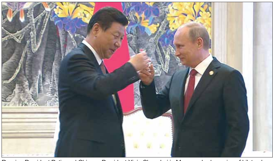
aviation, and a program of cooperation in cords, and published a declaration of intent to create a new economic architecture in the Asia-Pacific region.

At the BRICS Summit itself, and in a series of multilateral and bilateral discussions within and around this summit, the heads of state agreed on the creation of an entirely new economic and financial system, representing a fundamental alternative to the casino economy of the present system