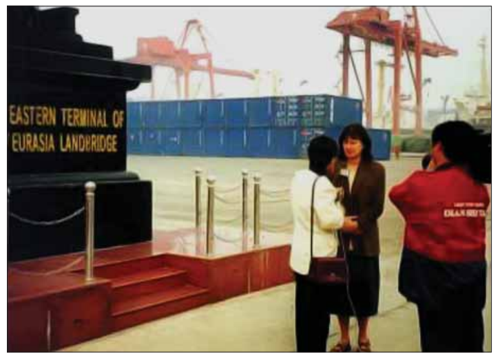
Helga Zepp-LaRouche in China, October 1998, at the Eastern Terminus of the New Eurasia Landbridge, at Lianyungang Port.

The entire world thus finds itself in such an alarming