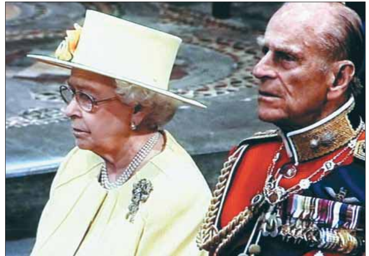
Queen Elizabeth and Prince Philip (2011). As they near their last days, they are making way for their embarrassment of a son to take the reins of the Empire.

At this point in time, the main visible manifestation of the British Empire, and the power of the British Crown, is the British