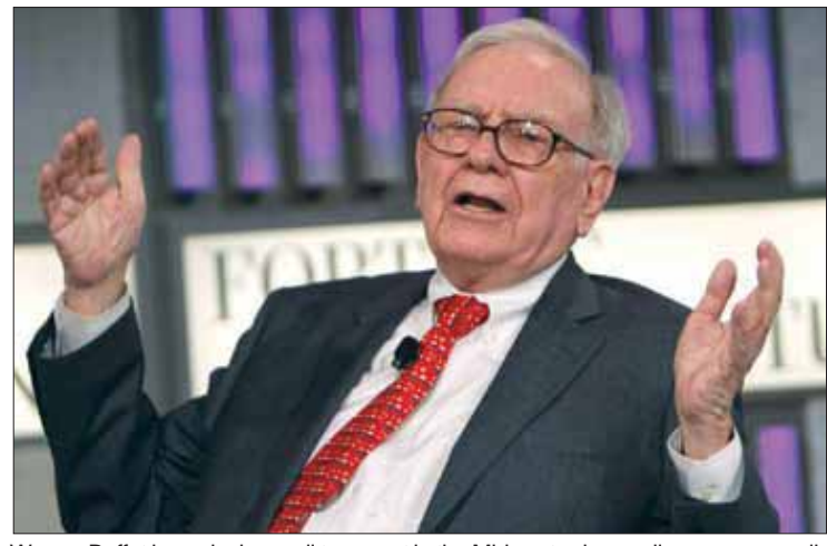
Warren Buffet has a lock on rail transport in the Midwest, where railcars are unavailable to farmers because they've been diverted to transport gas and oil from fracking.

In May 2009, Buffett was among those at the Billionaires'