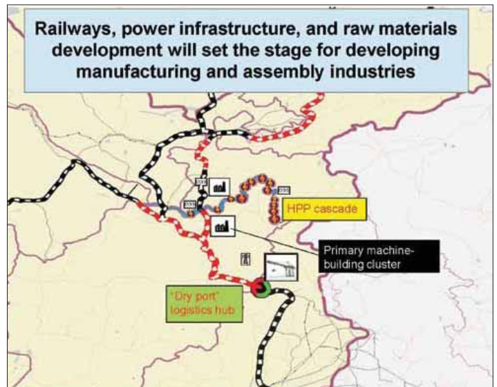
Figure 1. Broken lines on the map show existing (black) and proposed (red) railroads. A "dry port" logistics hub at the Pakistan-Afghanistan border, along a new Indian Ocean-to-Siberia rail corridor, would include switchover between narrow and wide-gauge railroads. The "HPP cascade" is the proposed series of hydroelectric power plants on the Panj River, which forms the Afghanistan-Tajikistan border.

The presentation made by Member of the European Parliament Pino Arlacchi, one of the few people in attendance from Western Europe, stirred the audience's interest, as he called the U.S.-NATO military presence an "occupation" of Afghanistan, which was impeding the country's development. Arlacchi is the former Executive Director of the UN Office of Drug Control and Crime Prevention who, as the European Parliament's Afghanistan Rapporteur, in 2010, collaborated with Ivanov on a European-Russian plan to eliminate the opium/heroin economy, at the same time as Russia put forward Rainbow-2; the Arlacchi initiative was quashed in the European Commission.