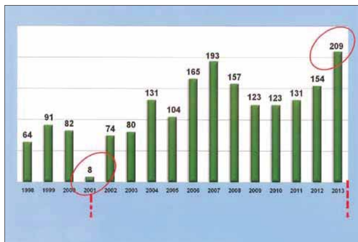
Figure 1. The production of heroin has increased more than 40-fold since the start of "Operation Enduring Freedom" in October 2001.

The negative consequences of the planetary drug production centers are enormous. This is particularly obvious in Afghanistan, which has become the main victim of large-scale drug production. Thus, for 14 years, since the start of Operation Enduring Freedom, more than a million people in Eurasia have died because of Afghan heroin, at least half of them Russian