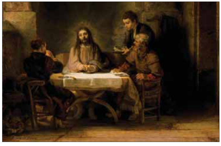
Christ depicted by Rembrandt in his "Pilgrims at Emmaus" (or "The Supper at Emmaus"), 1648.

utmost to enable mankind to embrace the achievements of progress, and thus to improve his livelihood. What is Promethean in man is his creative power, the divine spark of new knowledge which makes man truly free, and liberates him from the oppression of the oligarchical system. Just as Zeus, in Aeschylus' tragedy Prometheus Bound , punishes Prometheus for bringing fire to man by chaining him forever to a rock, so today the oligarchy hates and fears the creative mental powers of free individuals, which mean the defeat of oligarchical rule.