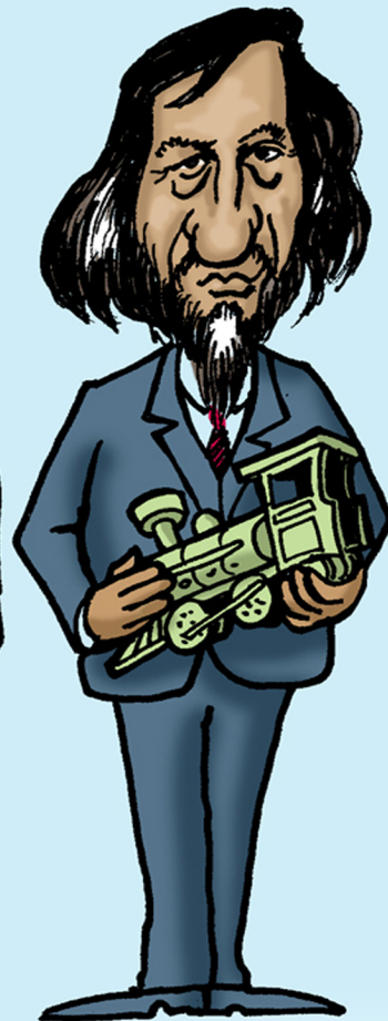
Rajendra Pachauri Head of IPCC